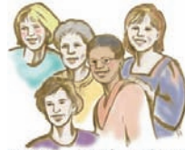
Women of the Church

The Women's Ministry would like to welcome all women from the parish for a Welcome Back Social Night . Join us in the Parish Hall for refreshments and a look at what this year's meetings will bring.